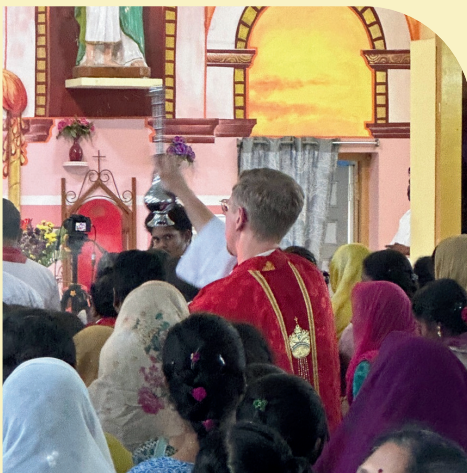
Mass at Church in Vijayawada, India