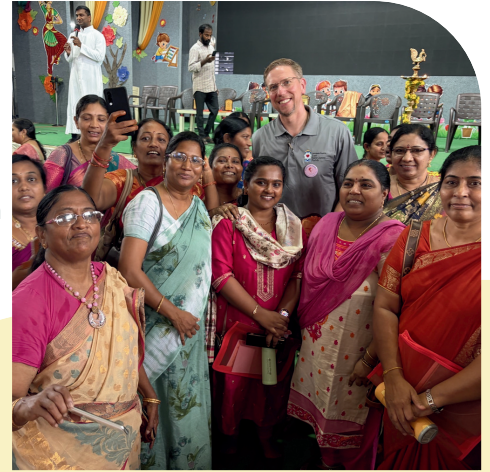
Mentors for Talitha Cumi Unnathi Girls

Young Women's Ministry of India Second Collection! 3:00PM—Confessions, St. Margaret Church