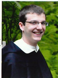
Dominican Friars of St. Joseph

With today's shortage of priests, one might assume that any man entering a religious community would naturally go on to be ordained. Historically, however, this has never been the case. Religious life—marked by the vows of poverty, chastity, and obedience—has always been recognized as a vocation in its own right, distinct from Holy Orders.