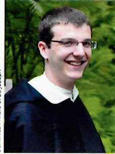
Dominican Friars of St. Joseph

With today's shortage of priests, one might assume that any man entering a religious community would naturally go on to be ordained. Historically, however, this has never been the case. Religious life—marked by the vows of poverty, chastity, and obedience—has always been recognized as a vocation in its own right, distinct from Holy Orders.