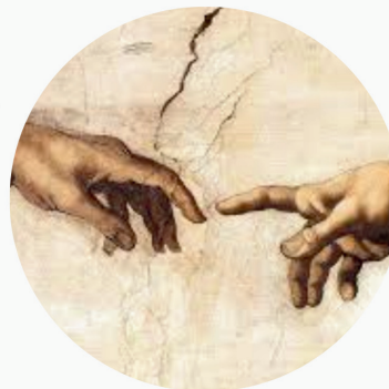
Michaelangelo - The Creation of Adam

"With all humility and gentleness, with patience, bearing with one another through love, striving to preserve the unity of the spirit through the bond of peace: one body and one Spirit, as you were also called to the one hope of your call; one Lord, one faith, one baptism; one God and Father of all, who is over all and through all and in all." (Ephesians 4:2-6)