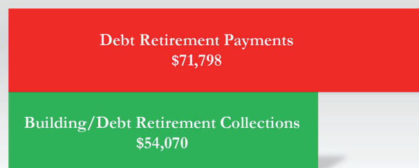
Debt Retirement Payments as of 31 December 2024