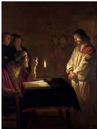
Christ Before the High Priest Gerard van Honthorst